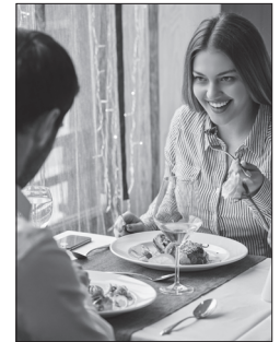
10 e _____ out