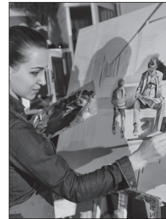
9 p _____