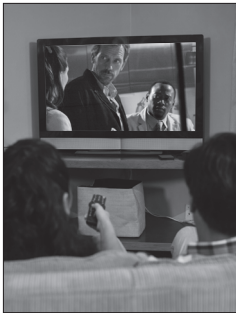
6 w _____ TV