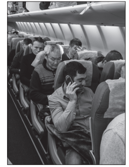
5 fl _____