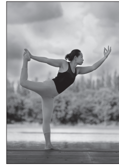
4 d _____ yoga