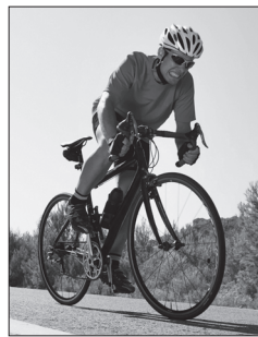
13 c _____