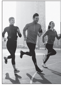
3 r _____