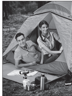
8 c _____