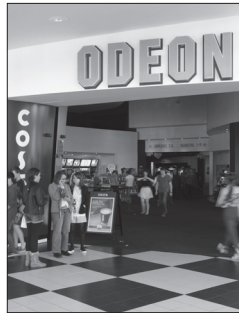
7 g _____ to the cinema