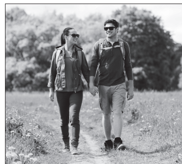
17 g _____ for a walk