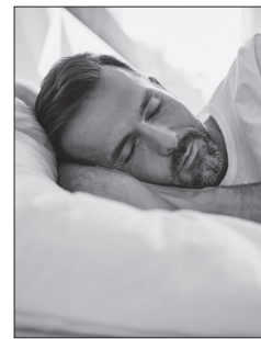
14 sl _____