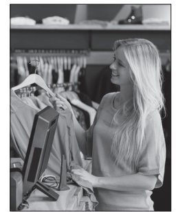
15 b _____ clothes