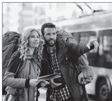
16 tr _____