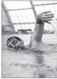
2 sw _____