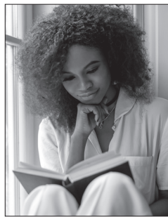
12 r _____